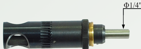
Standard Type Skirt with Polished Foot