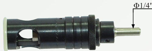
Standard Type Skirt with Nylon Foot Piece