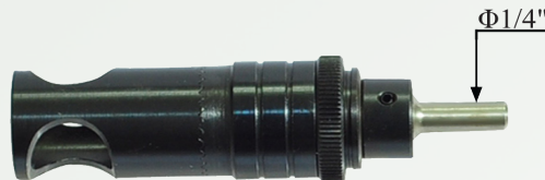
Standard Type Skirt with Polished Foot